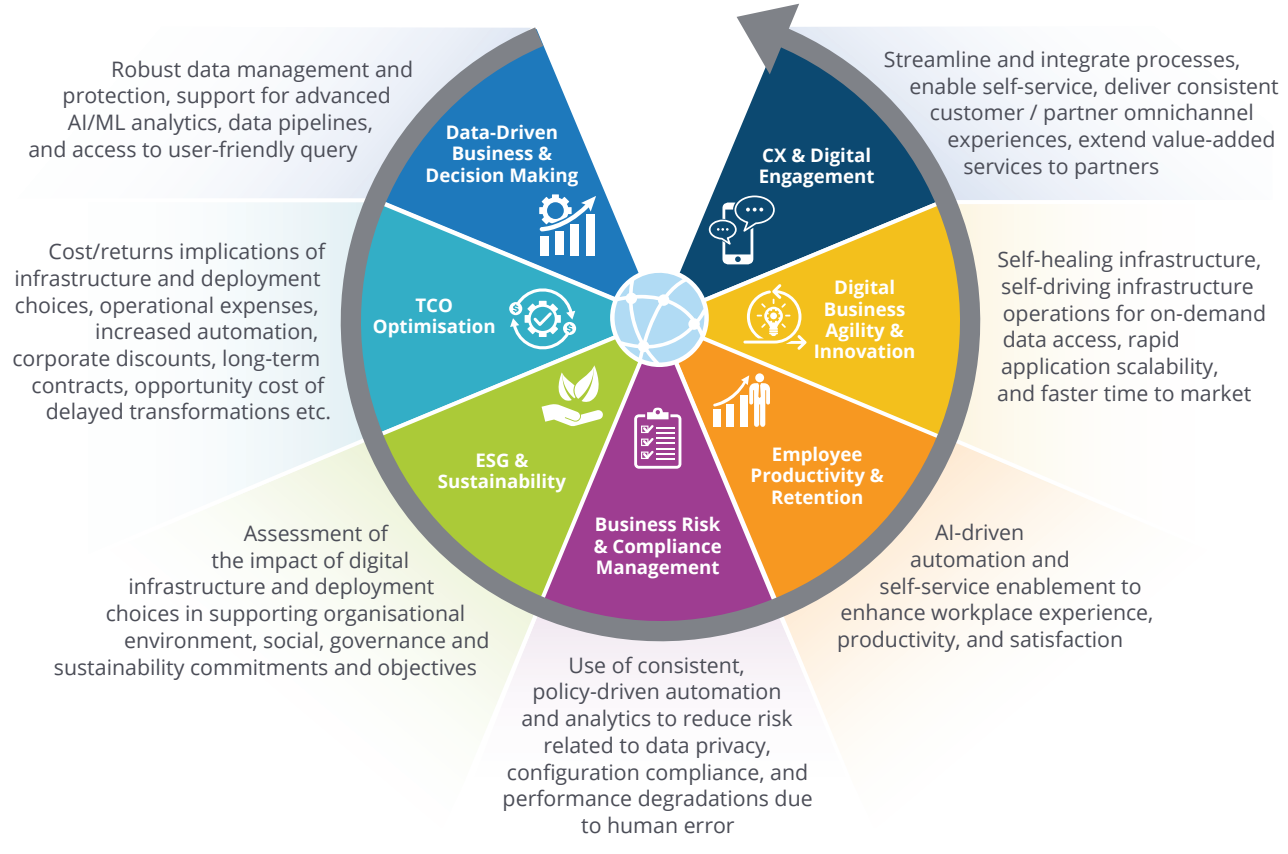
Figure 2: Business Outcome-Driven Digital Infrastructure

environments to deliver specific business outcomes. The business outcome-driven Digital Infrastructure Framework detailed in Figure 2 can help enterprises identify the key outcomes desired from their digital infrastructure initiatives, and define meaningful KPIs to drive these initiatives to success: